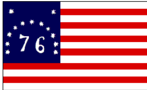
The Bennington Flag of the Vermont Militia.

- Edward Rutledge, Arthur Middleton, and Thomas Heyward, Jr., the other three South Carolina signers, were taken by the British in the siege of Charleston. They were carried as prisoners of war to St. Augustine, Florida, where they were singled out for indignities. They were exchanged at the end of the war, the British in the meantime having completely devastated their large landholdings and estates.