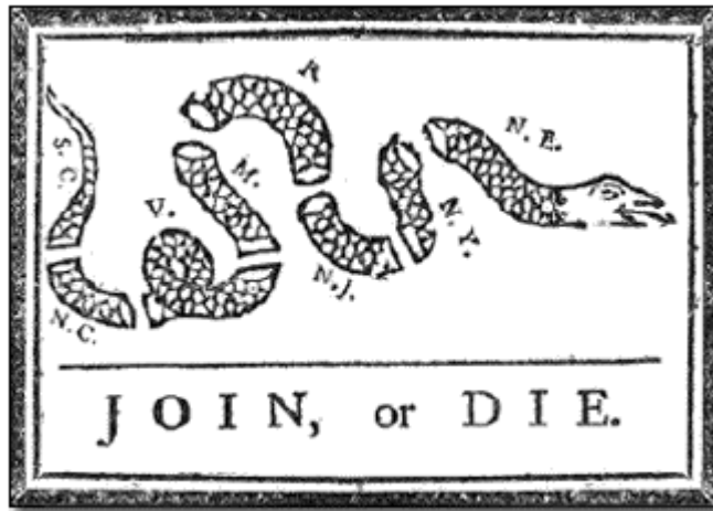
The rattlesnake: pre-revolution America's symbol of defiance.

Louis Morris, the fourth New York delegate, saw all his timber, crops, and livestock taken. For seven years he was barred from his home and family.